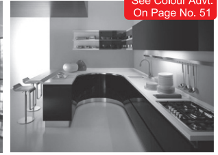
See Colour Advt. On Page No. 51

H.O: NEAR SURAJ PALACE BANQUET HALL, PALOURA, JAMMU. | B.O: Opp. Wine Factory Talab Tillo, Jammu. | (M): 9419146241