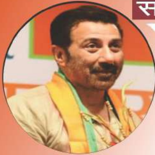
Sunny Deol (Hon'ble Member of Parliament) District Gurdaspur